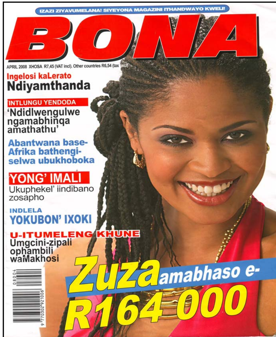
[BONA, April 2008 Xhosa]

7.2 Qwalasela eli qweqwe lemagazini uze uphendule imibuzo elandelayo: