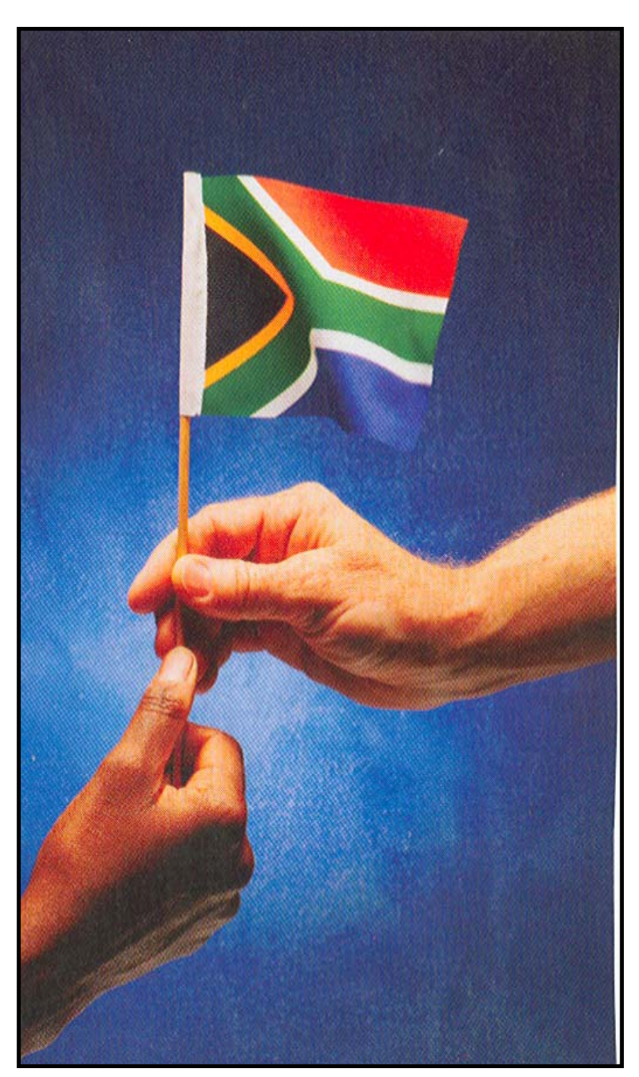
[Original photograph extracted from Satyagraha]