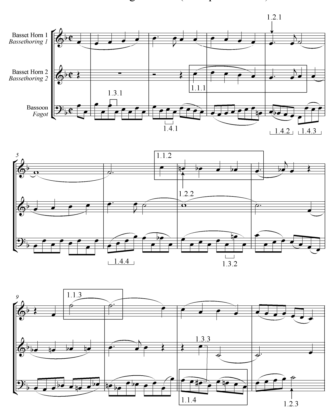
Mozart - Adagio K.410 (excerpt/uittreksel)

Study the music excerpt and answer the following questions.