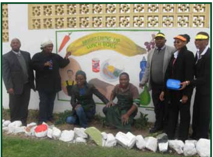
Wall painting at the entrance of Jityaza Primary School