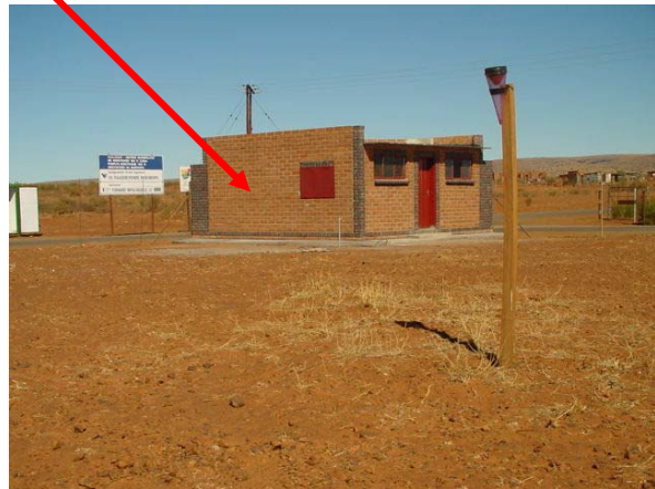
Making of mud / clay bricks Northern Cape