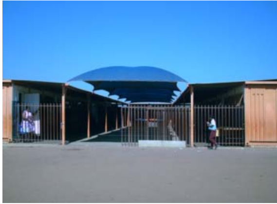
1.3.6.7. Prefabricate building material used as walls on site