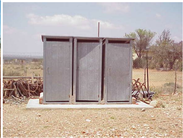
1.3.3.4. Enviro loo on site