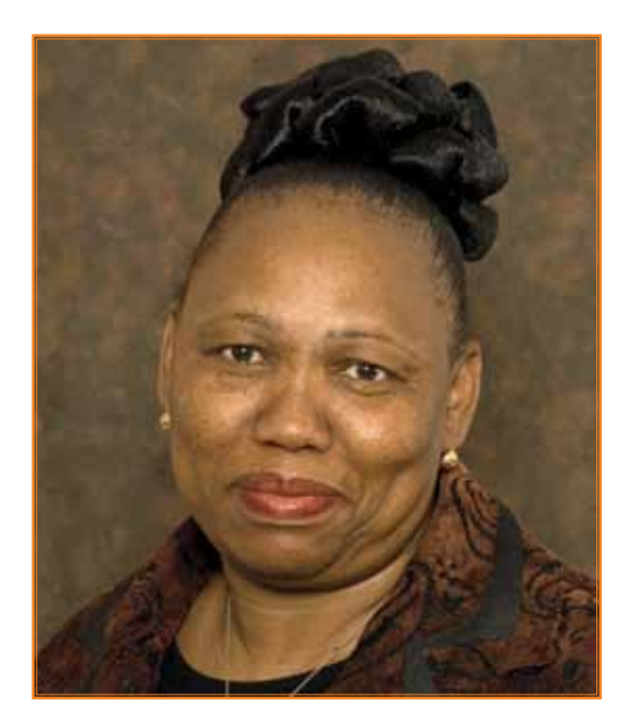
Mrs Angie Motshekga, MP Minister of Basic Education