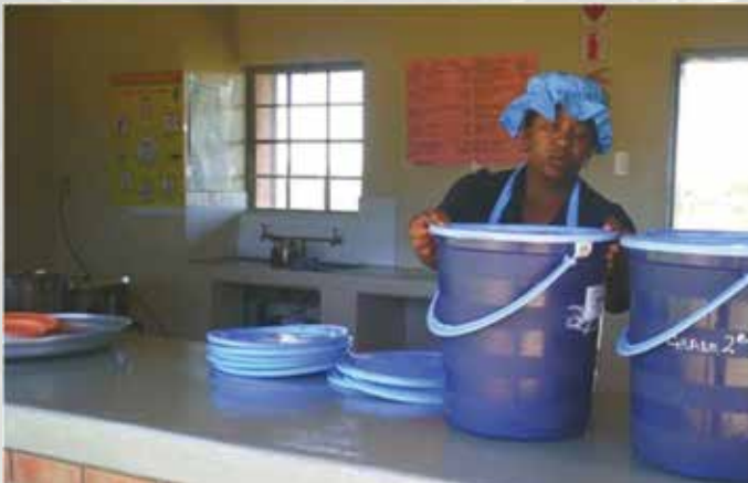
VFH preparing meal for learners Empisini Primary School

The Provincial Education Department (PED) provided meals to 2 140 959 learners in 5 248 quintile 1 – 3 primary, secondary and selected special schools, a quarter of a million more children than in the previous year (245 439), representing a 13% increase. The programme was extended to 361 Q3 secondary schools in April 2011.