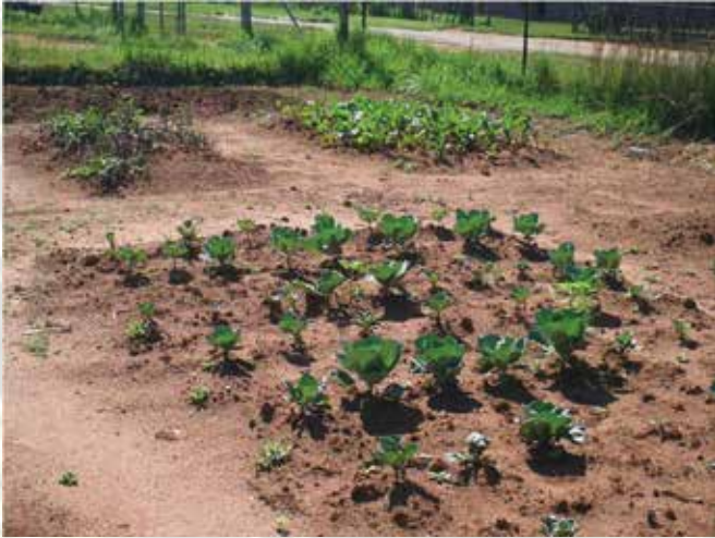
Paulpietersburg Primary School

2 227 new school gardens were established over the year. Learners were encouraged to grow food gardens through the Siyazilimela school garden competition sponsored by the Department of Agriculture. In addition, 250 water harvesting tanks from the Department of Water Affairs were distributed to 125 schools in Zululand, Othukela, Uthungulu and Umzinyathi districts.