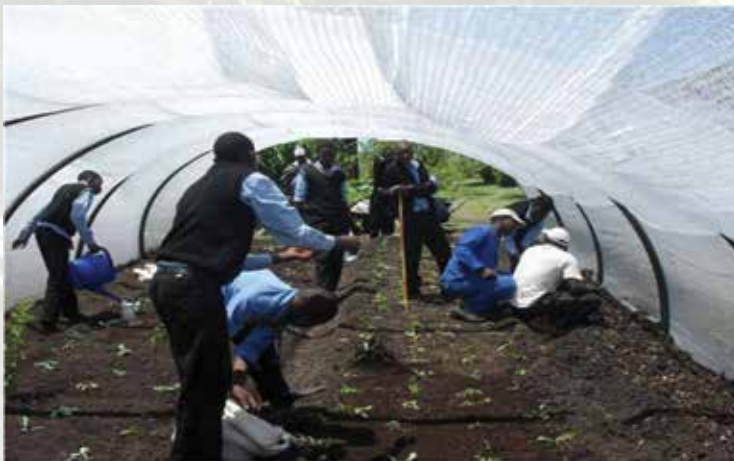
Learners at Evulingcondo primary (Mpumalanga Province) planting seedlings in a vegetable tunnel

A Memorandum of Agreement was signed between the Department of Basic Education (DBE) and the Tiger Brands Foundation (TBF). Amongst others, the TBF committed to provide an in-school breakfast programme to selected schools, to improve food preparation areas in identified schools and conduct relevant research, in partnership with DBE. By the end of March 2012 all primary school in Alexander Township were on the TBF breakfast programme. Selected schools in Westren Cape (3), Kwazulu Natal (3) and Limpopo (3) were included in the TBF breakfast programme.