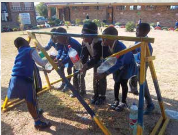
Learners wash hands before eating in Tsembaleftu Primary School

Educational material was distributed by district officials to schools. The purpose of the materials is to provide information to learners, parents and schools on making good choices for a healthy lifestyle.