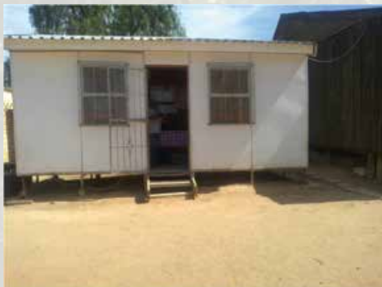
Mobile kitchens provided by the Western Cape Provincial Education Department

The coastal region is famous for snoek and sweet potatoes, as well as dishes made using Indian and/or Malayan spices. Another particularly well-loved local favourite is umnqusho, made from samp and beans. The region is also known for the excellent wine produced for local and overseas markets.