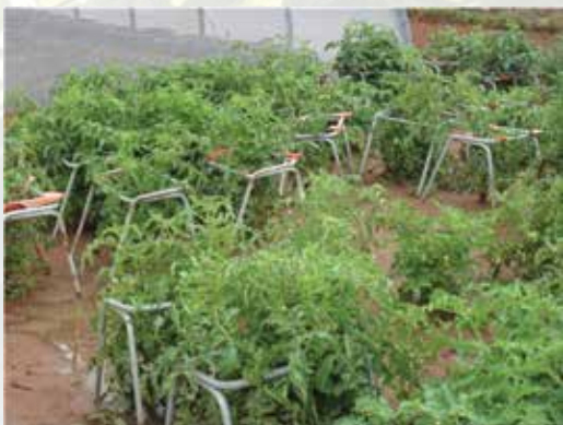
Vegetable Garden: Boijane Secondary School in North West

The PED established 638 vegetable gardens in schools and erected two vegetable tunnels at Boijane Intermediate and Mokasa Primary in Dr Segomotsi Mompoti district.