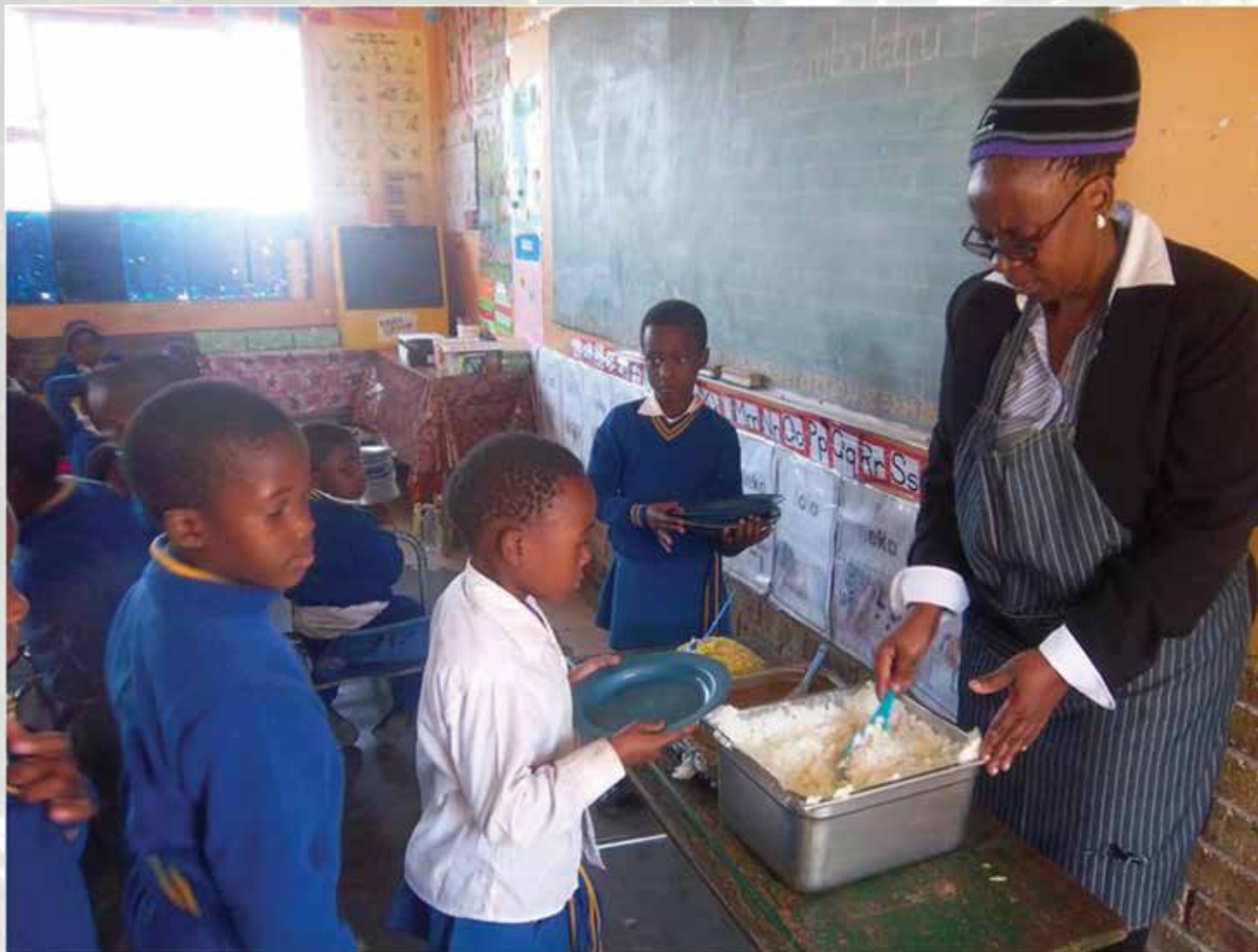
An Educator dishing-out for learners in a classroom

Meals served to learners follow the 'Food Based Dietary Guidelines', provided by the Department of Health which provide guidance for meals that contain variety of foods including fresh vegetables and fruit.