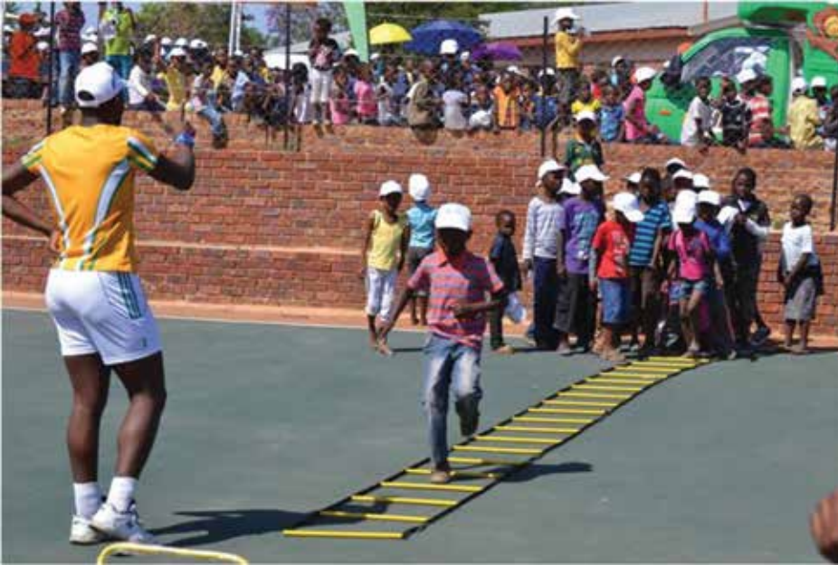
Learners in Modimolle having fun during celebration of NNW