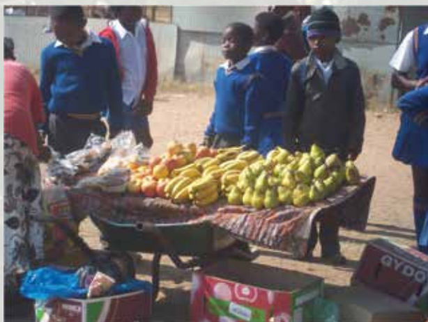
School Vendor selling healthy food to learners

The province distributed 3 575 posters to schools. However, the integration of Nutrition Education into the curriculum still requires improvement.