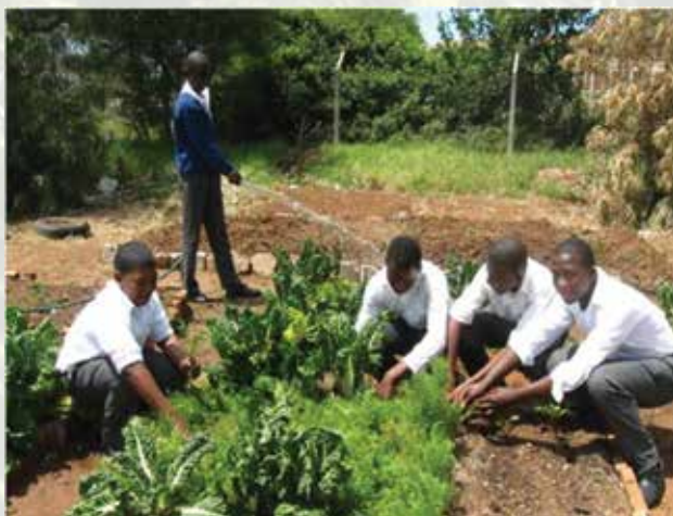
Enkwenkwezini Primary School