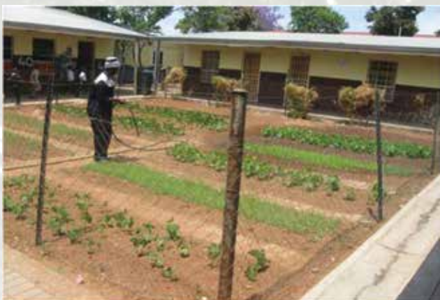
Sedibeng Primary School