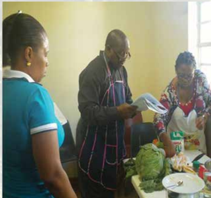
Training of Volunteer Food Handlers on meal planning and preparation