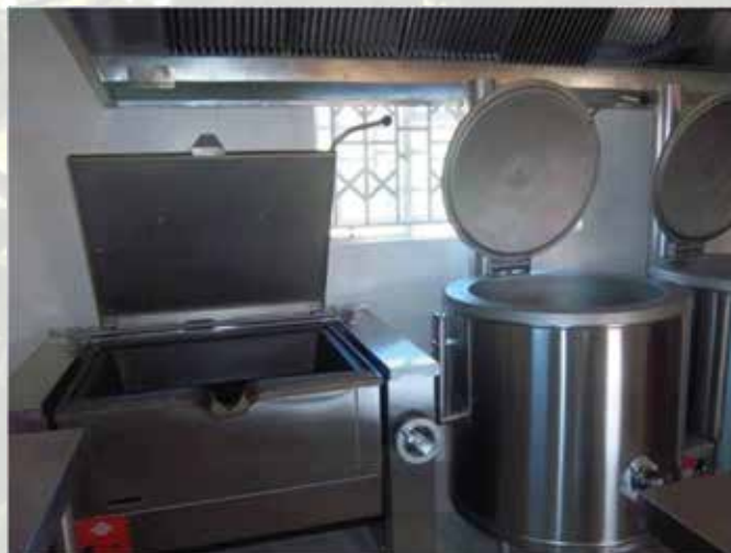
Industrial cooking equipment provided to the winning school (Tsembaleftu Primary School- Mpumalanga)

The winning school received industrial cooking equipment as well as a Certificate.