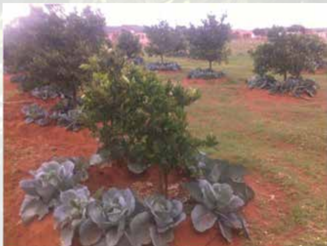
Hlagatse Primary School