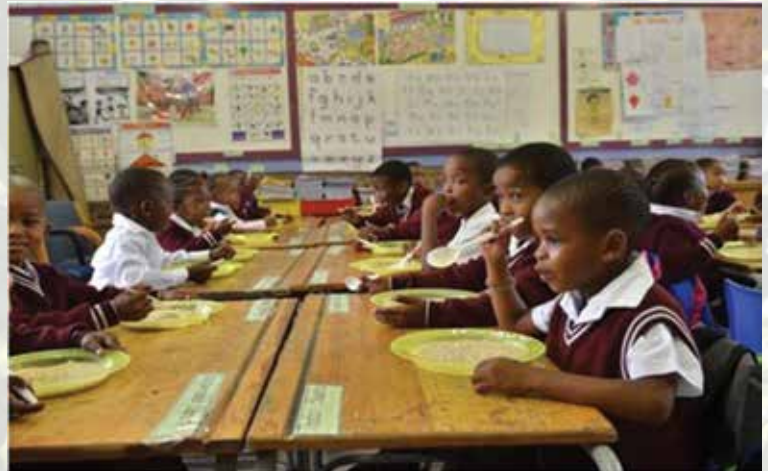
Learners enjoying breakfast sponsored by Tiger Brands Foundation

A Memorandum of Agreement was signed between the Department of Basic Education (DBE) and the Tiger Brands Foundation (TBF). Amongst others, the TBF committed to provide an in-school breakfast programme to selected schools, to improve food preparation areas in identified schools and conduct relevant research, in partnership with DBE. By the end of March 2012 all primary school in Alexander Township were on the TBF breakfast programme. Selected schools in Westren Cape (3), Kwazulu Natal (3) and Limpopo (3) were included in the TBF breakfast programme.