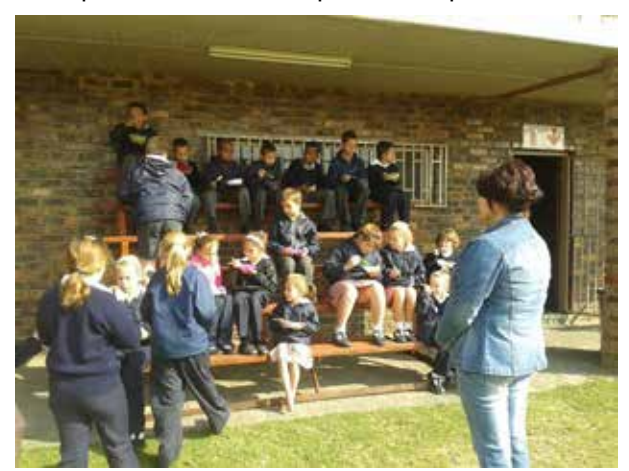
Empisini Primary School, Umzinyathi District

As a part of the drive to promote equal economic opportunities in the province, NSNP utilises the services of Local