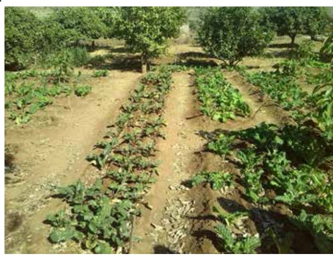
JJ Matsane Primary School, Bohlabela District Modondo Secondary School, Bohlabela District

The school Principals and NSNP coordinators who attended were trained on the management of the programme. The content of the training included: the Conditional Grant framework, administration of the programme, financial management, nutrition education and food production.