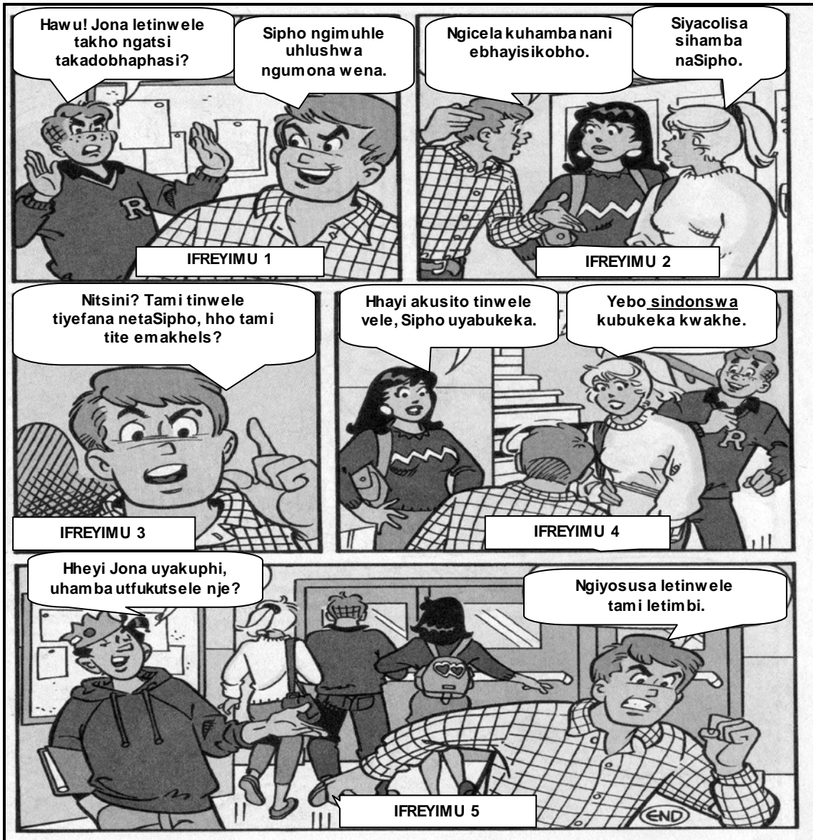
[Itsetfwe encwazini yemaCartoons, Likhasi 6]