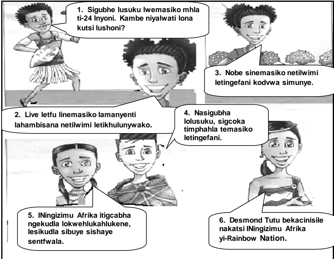
[Itsetfwe ku-Drum, 2012, Likhasi 21]