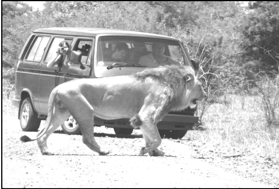
[Itsetfwe ku-Bona, Inhlaba 2013, Likhasi 13]