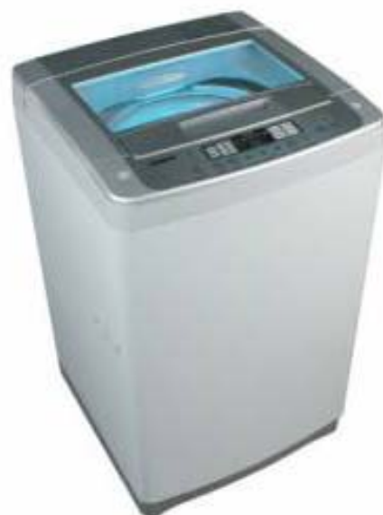
FIGURE 2: Siemens top-loader washing machine