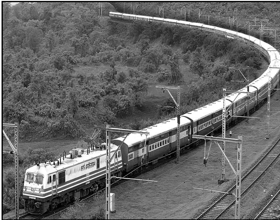
[Itsetfwe ku- www.google.co.za ]