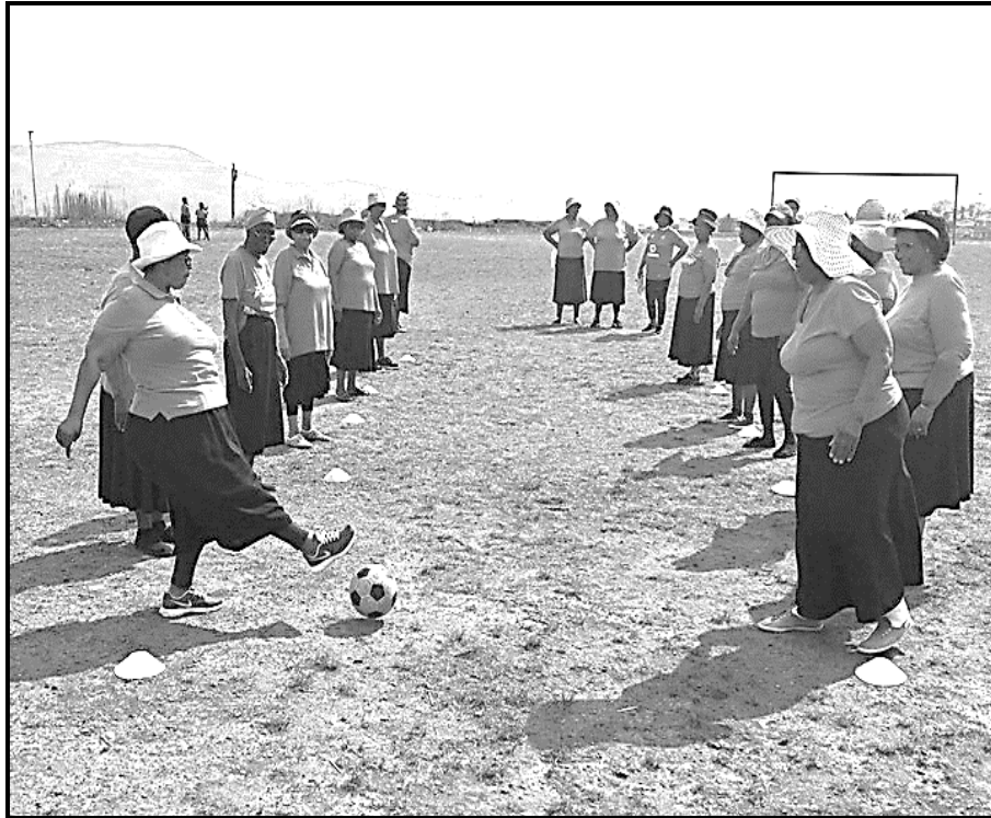
[Itsetfwe ku- www.google.co.za ]