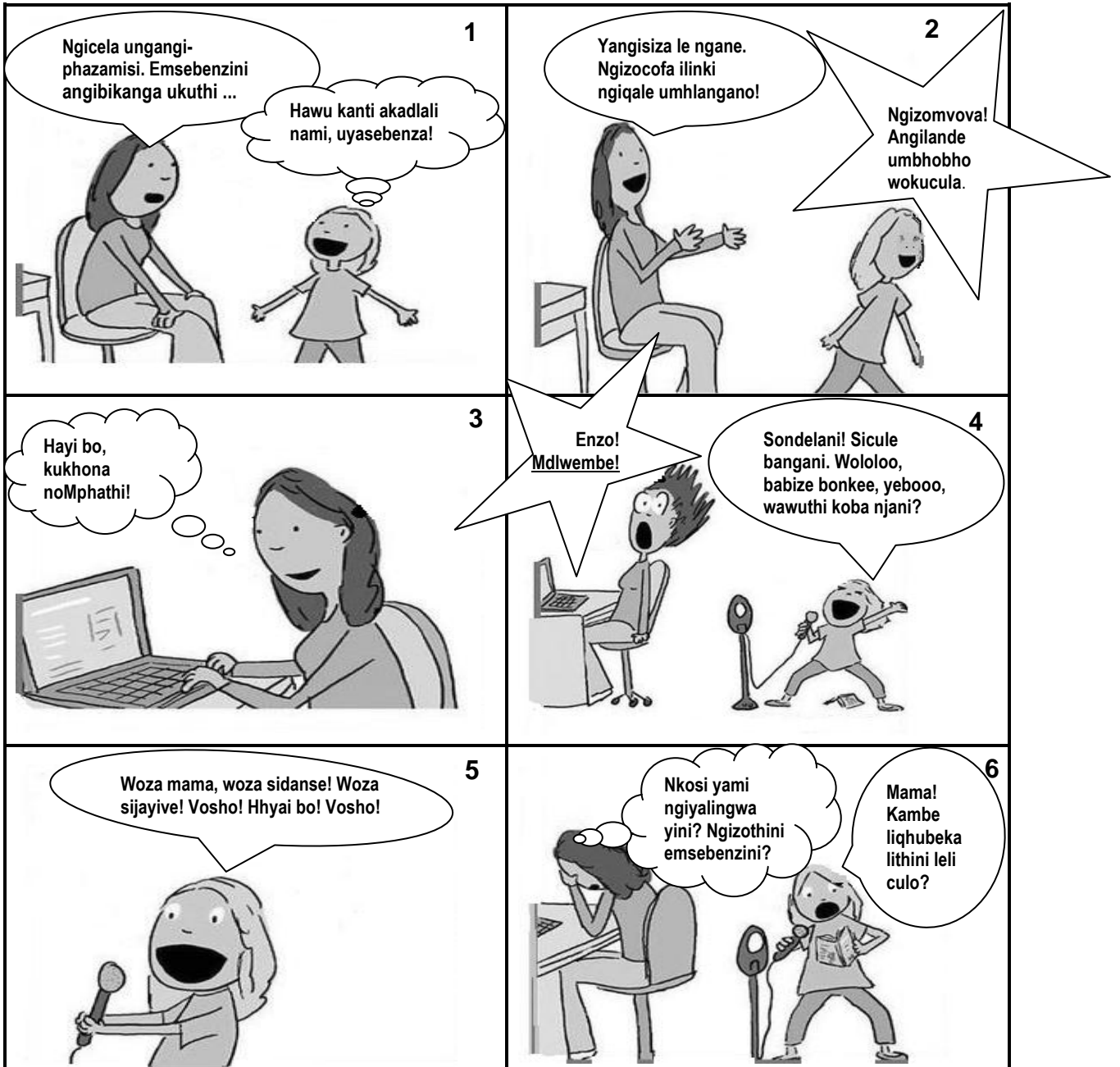
[Icashunwe ku- www.HedgerHumor.com yahunyushwa kabusha]