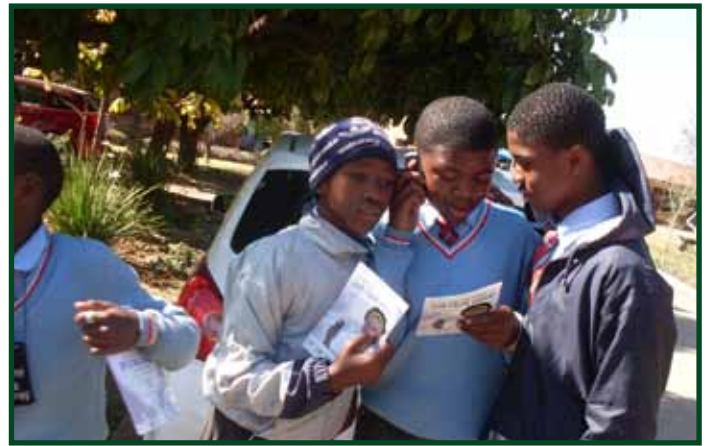
An Educator and Learners testing the NSNP reporting toll free number