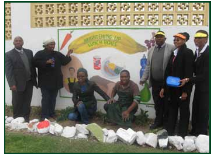
Wall painting at the entrance of Jityaza Primary School