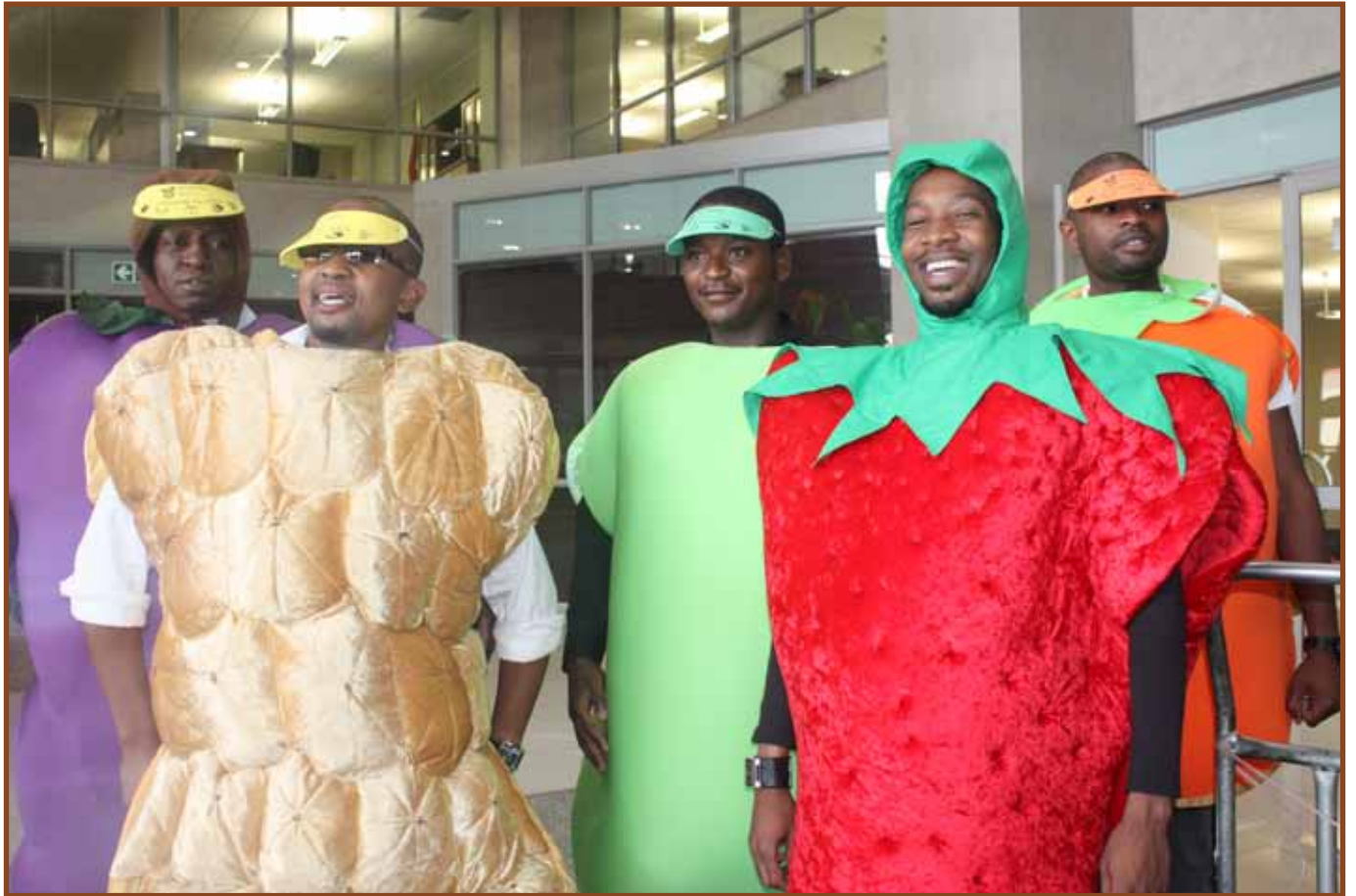
National Nutrition week celebrated in the Department of Basic Education