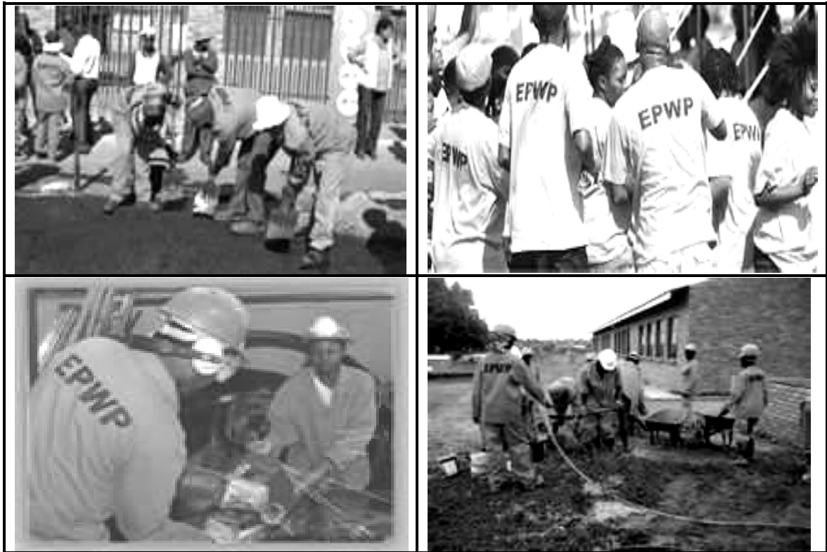
[Zithethwe ku-inthanethe yomNyango wezaManzi newezeBhoduluko]