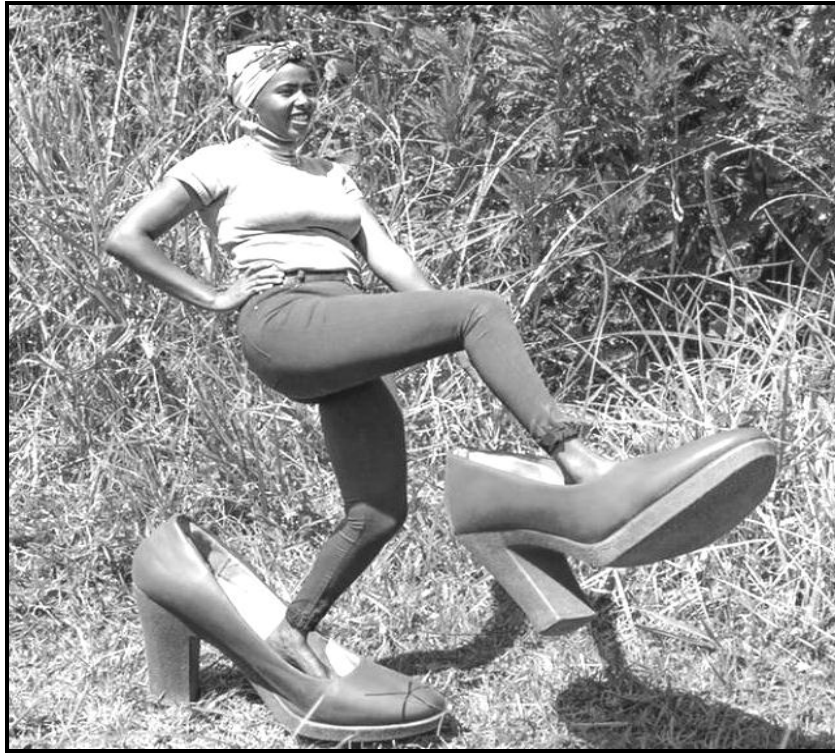
[Ucatshulwe kwi-intanethi: @minicheps]