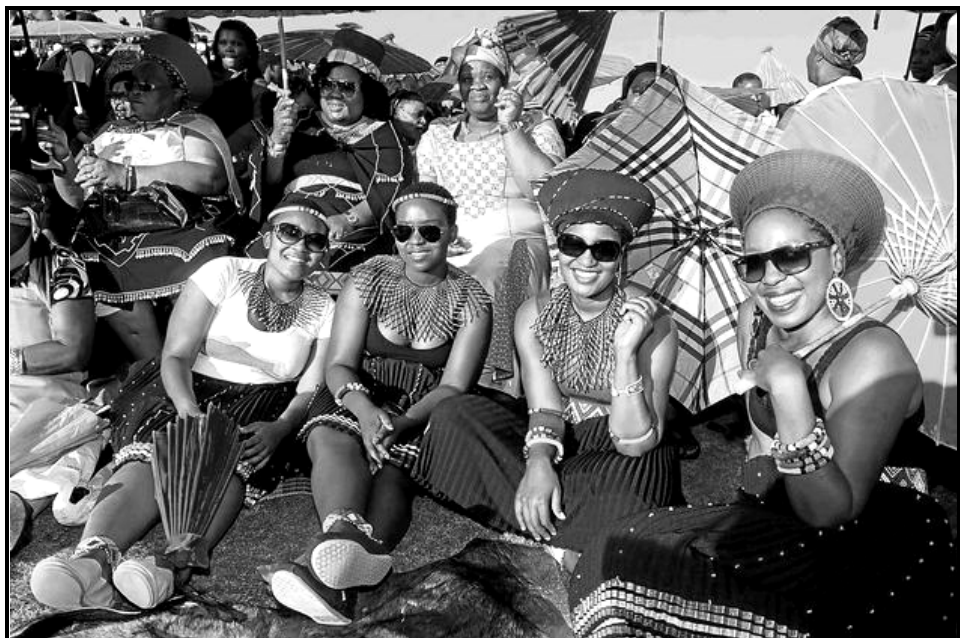
[Internet, August 2012]