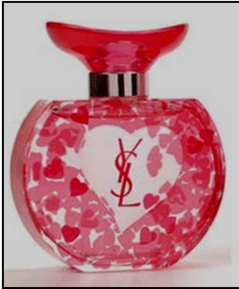
FIGURE A: Young Sexy Lovely , fragrance by Yves Saint Laurent, (USA), 2011.