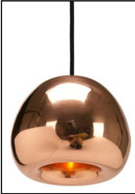
FIGURE A: Coppershade lamp inspired by British heritage, Tom Dixon (UK), 2005.

3.1 Refer to FIGURE A and FIGURE B below and answer the questions that follow.