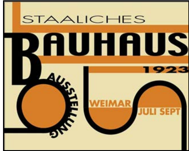
FIGURE G: Bauhaus exhibition poster , designer unknown (Germany), 1923.

4.2.1 Name ONE other designer from EACH of the above styles/movements. (2)