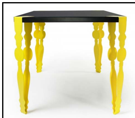
FIGURE E: Flab table , Kenyon Yeh (London), 2011.

Choose TWO of the tables above and answer the following questions: