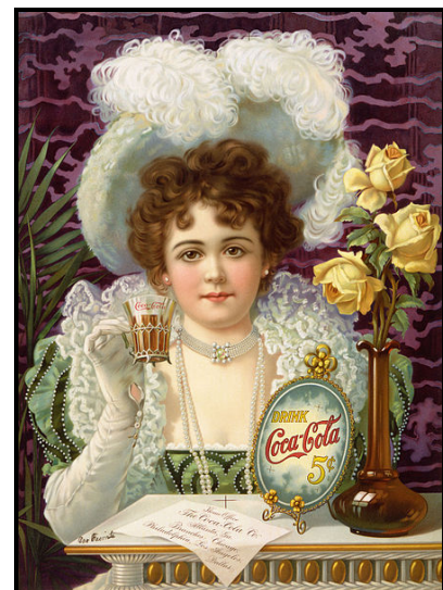
FIGURE C: Coca-Cola advertisement (USA), 1890.

Study the images above and give reasons why the designs in FIGURE B and FIGURE C would not be relevant in a contemporary South African society.