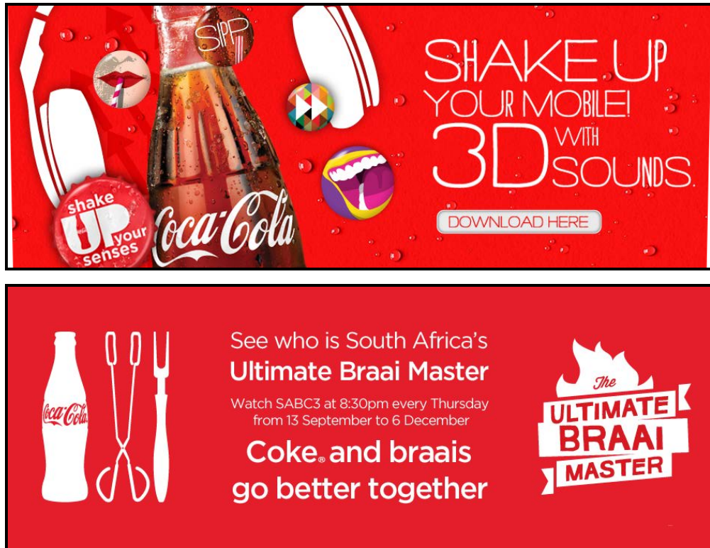
FIGURE A: Coca-Cola billboard advertisements, David Butler (USA), 2013.

7.2.1 With reference to the statement above, explain how both the advertisements for Coca-Cola (FIGURE A) have been adapted to meet the needs of a fast-changing target market.