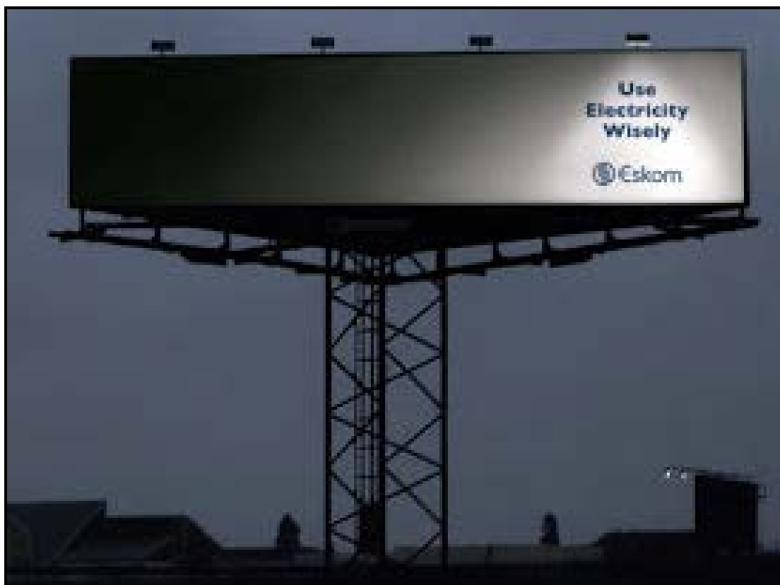
FIGURE A: Eskom Billboard , designer unknown (South African), 2008.

David Ogilvy from Jupiter Room Agency once wrote: 'I have a passion for landscape, and I have never seen one improved by a billboard.