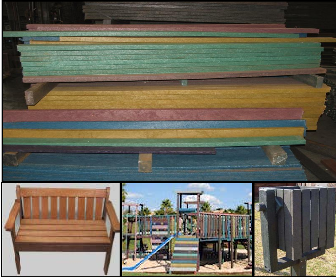
FIGURE C: Recycled plastic planks (timber) by Green Plastic Designs (South Africa), 2009.

6.3.1 What are the long-term environmental benefits of the materials used in FIGURE C? (2)