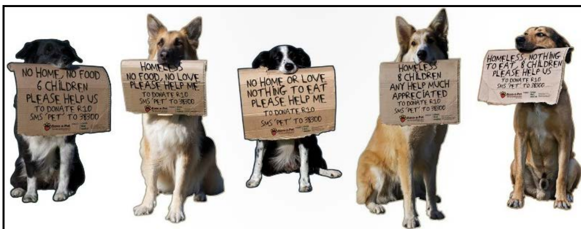
FIGURE B: Save a Pet designed by Amor Coetzee and Jedd McNeilage (South Africa), 2009.

5.2.1 Discuss the inspiration for the Save a Pet campaign in FIGURE B. (4)