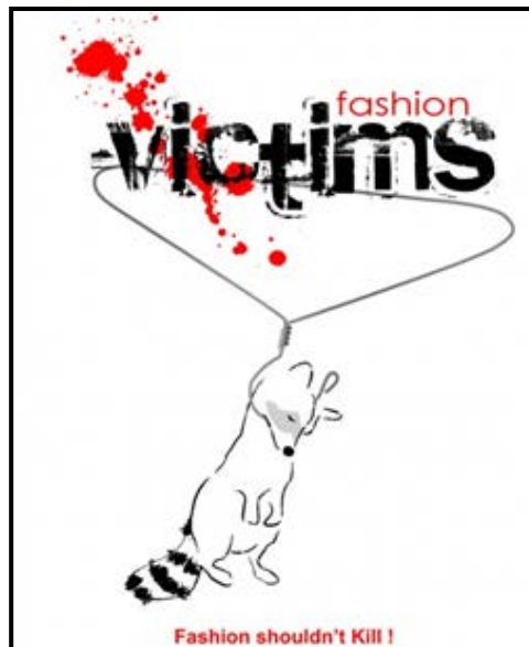
FIGURE A: Poster by an unknown designer.

5.1.1 How does the designer in FIGURE A above visually convey the message of the poster? (3)