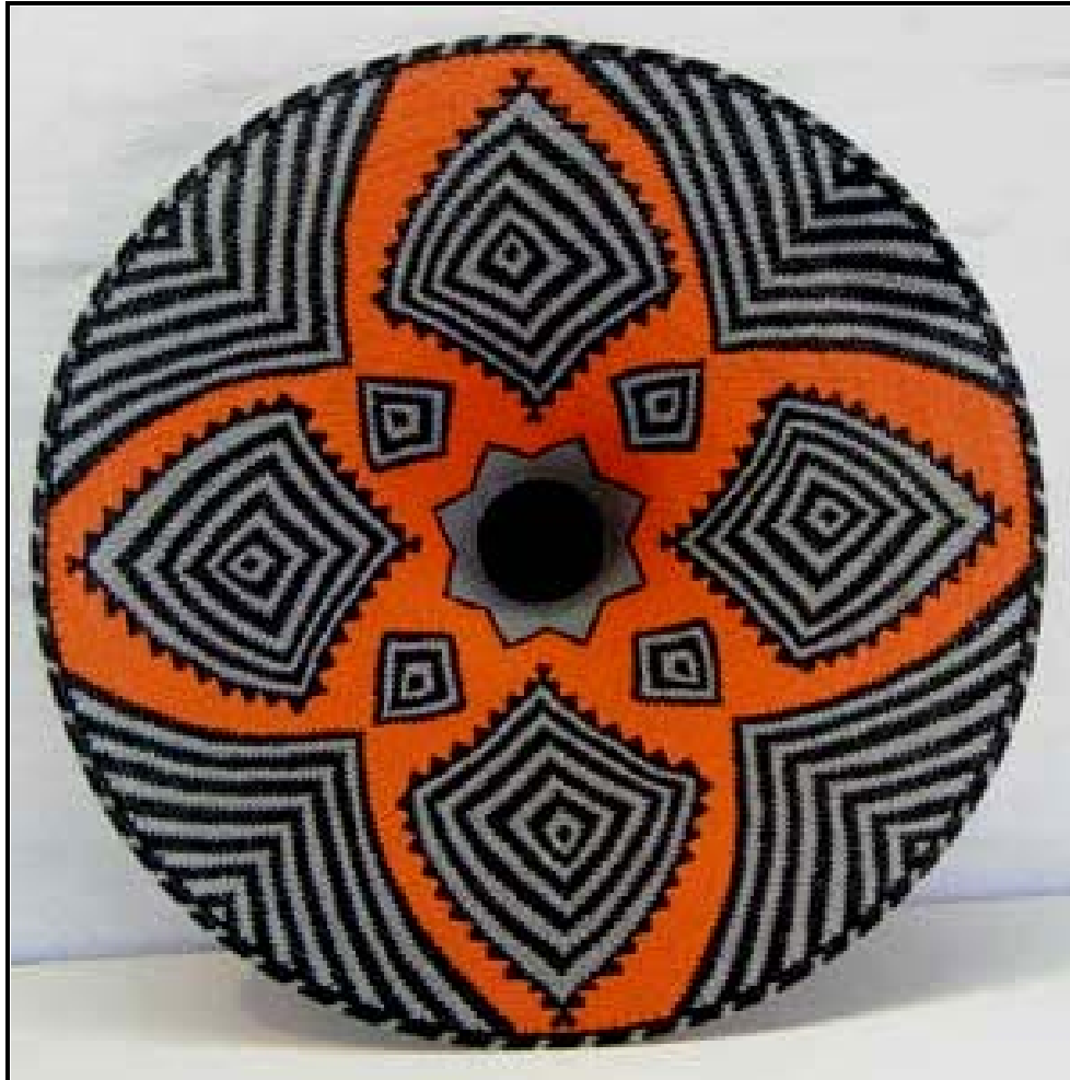
FIGURE A: Telephone wire bowl by Zodwa Maphumulo (South Africa), 2010.

Discuss the use of the following design elements and principles in FIGURE A: