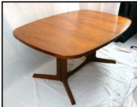
FIGURE C: Dining table , Niels Moller (Denmark), 1950.