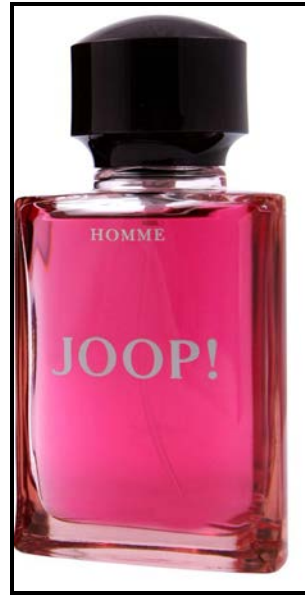
FIGURE B: JOOP! , fragrance by Wolfgang Joop (Germany), 1978.

Compare the visual sources (FIGURE A and FIGURE B) above and discuss how they could challenge and/or reinforce stereotypes by referring to the use of the following: