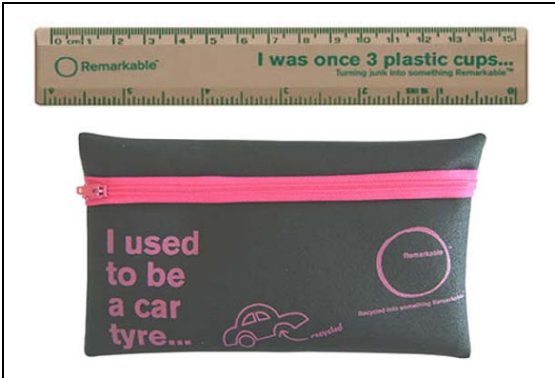
FIGURE A: Ollymolly products made from recycled materials by Remarkable (South Africa), 2011.