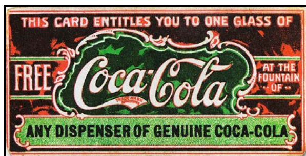
FIGURE B: Coca-Cola coupon (USA), 1896.