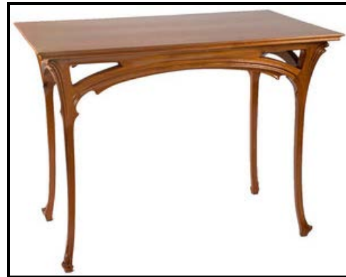
FIGURE B: Table , Henri Sauvage (France), circa 1900.