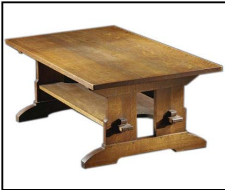
FIGURE A: Trestle table , L&JG Stickley (USA), circa 1910.

4.1 Each table (FIGURES A to E) below represents a different style/movement from Western design history.