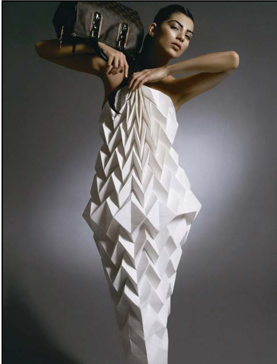
FIGURE B: Eco-dress by Diana Gamboa (Colombia), 2011.

[White paper was used to create this origami-inspired dress.]