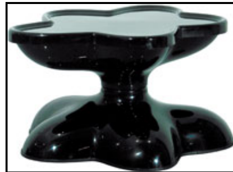
FIGURE D: Molar Group coffee table , Wendell Castle (USA), 1969.