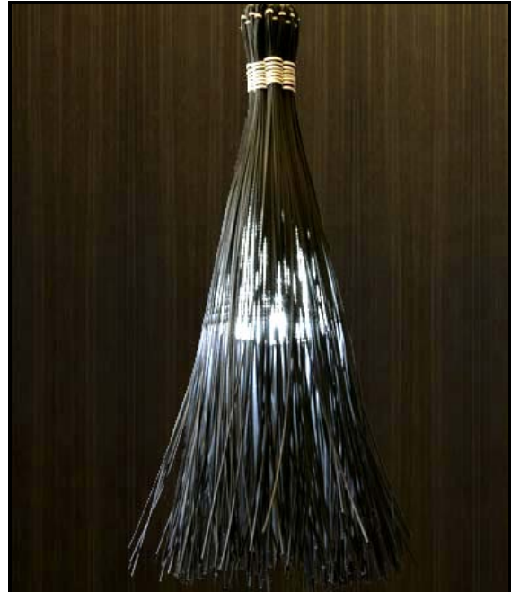
FIGURE B: You missed a spot lamp inspired by a traditional broom, Van de Vlam (South Africa), 2011.

3.1.1 Which lamp (FIGURE A or FIGURE B) would you like to own? Give TWO reasons for your choice. (2)