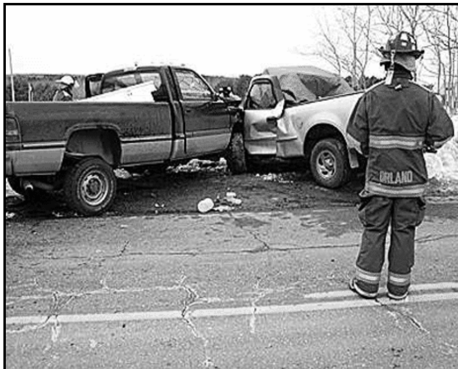
[ www.google.com ]