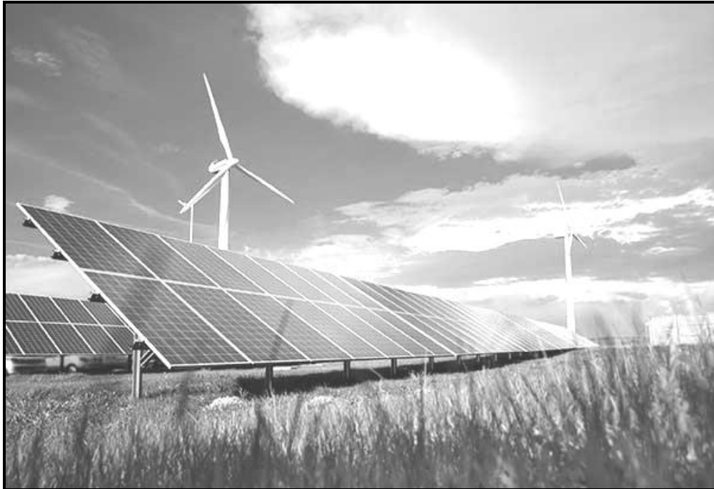
[Uthatyathwe ku- www.dedea.gov.za ]