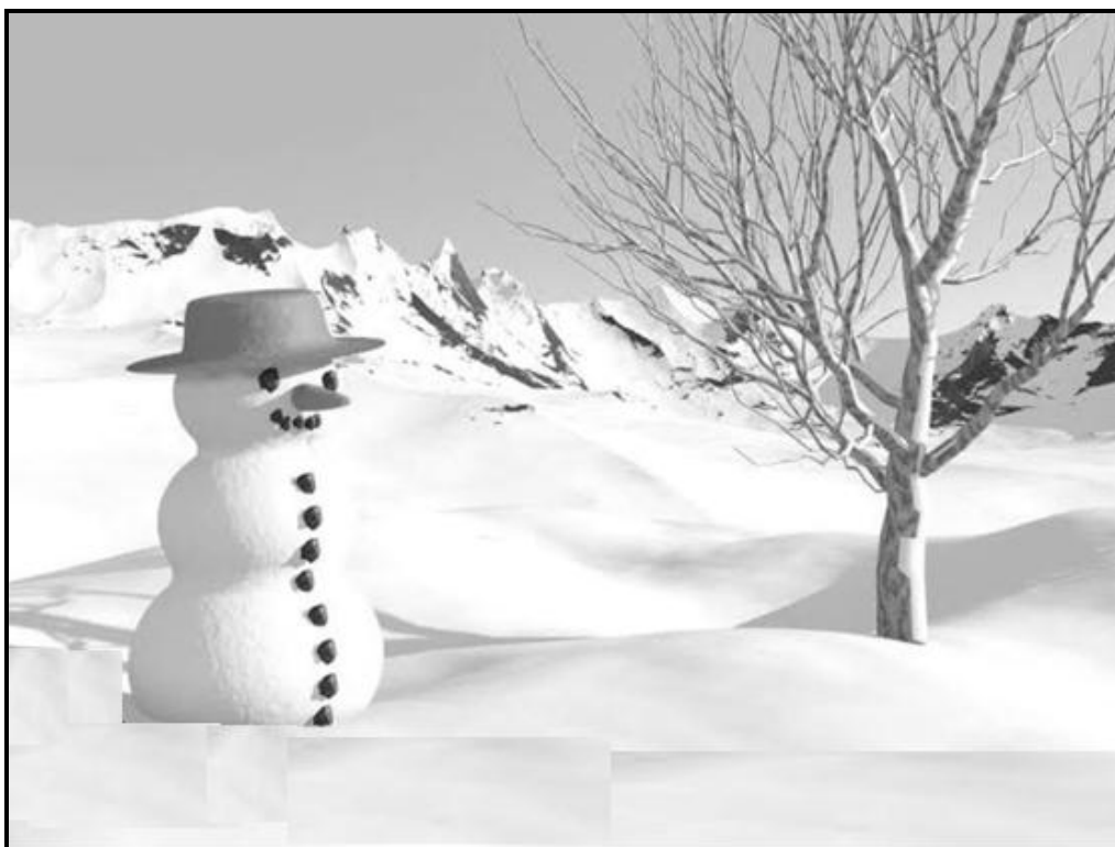
[Uthatyathwe ku- www.planetware.com ]