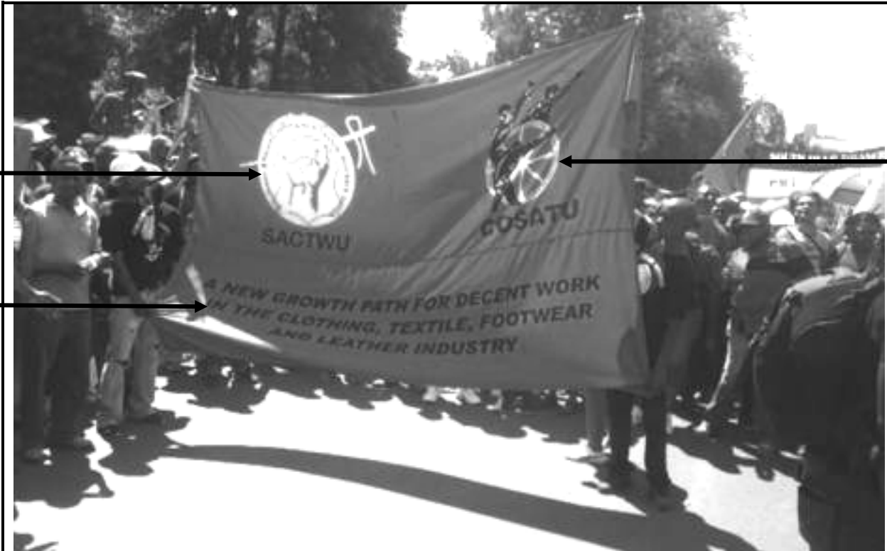
[From http://ewn.co.za/2015/10/07/Cosatu-marches-underway-in-CT-and-JHB . Accessed on 20 January 2018.]

The photograph below, by K Mogale, appeared on the web blog of Eye Witness News . It shows members of the Congress of South African Trade Union (COSATU) and the South African Clothing and Textile Workers Union (SACTWU) marching in Cape Town on 7 October 2017.