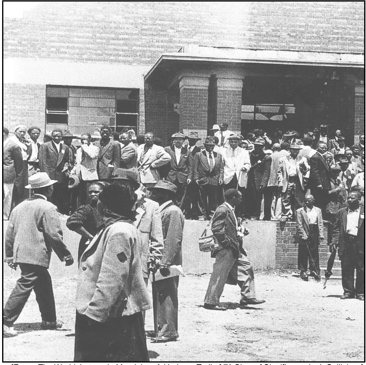
[From: The World that made Mandela – A Heritage Trail of 70 Sites of Significance by L Callinicos]

This photograph, by an unknown photographer, shows Africanists being removed from a meeting of the ANC at Orlando Hall in November 1958. The Africanists later formed the Pan-Africanist Congress led by Robert Sobukwe.