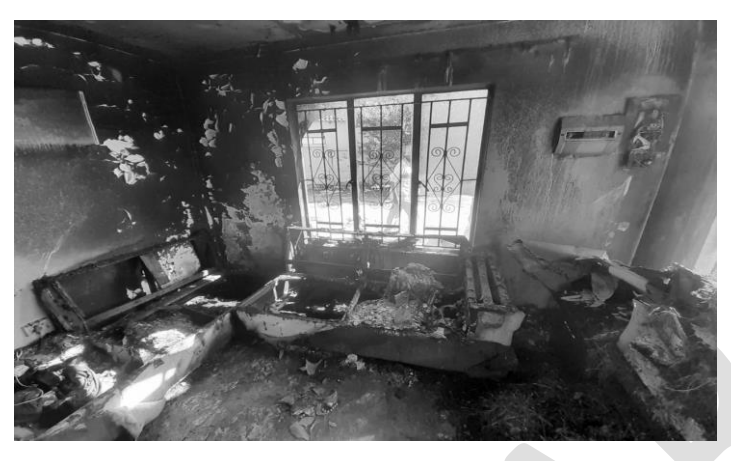
[Adapted from Google Images, accessed on 3 April 2023]

Give THREE suggestions on how you can volunteer to assist the family affected by fire. Motivate your suggestions. (6)