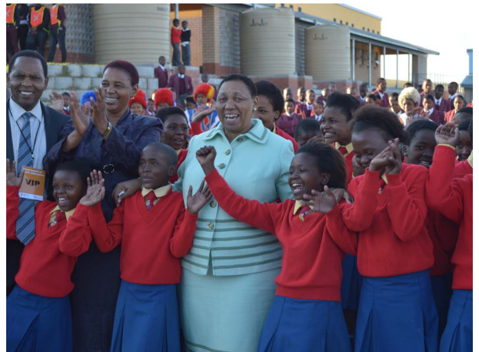
Joyous celebration with the learners of Nobantu and their Principal.