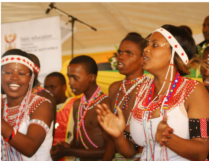
The pride of a people