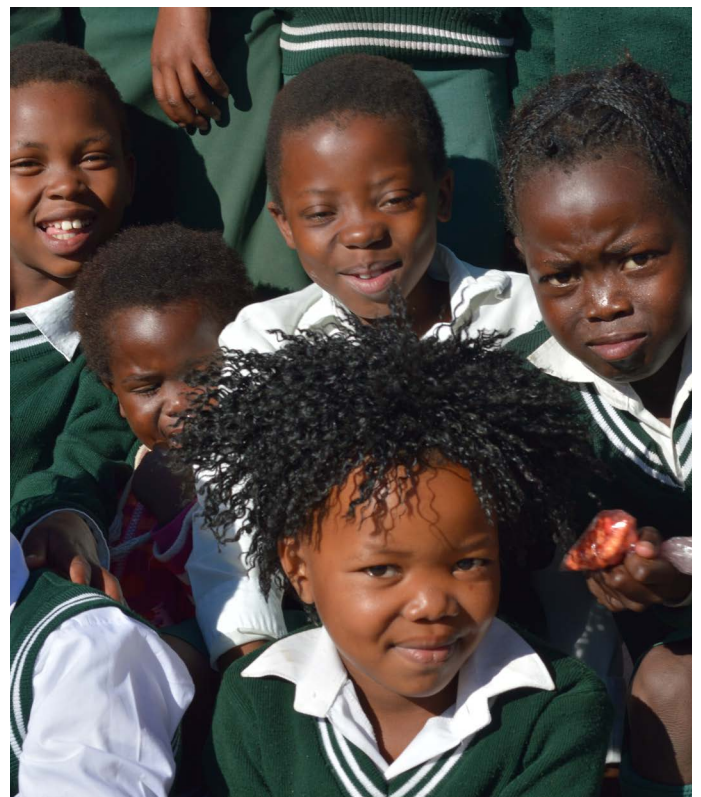
The future awaits at Dumile