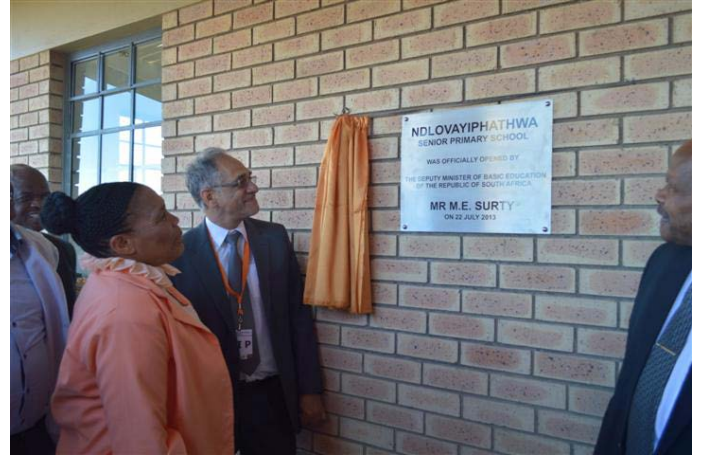
Rhythms of the Eastern Cape, A new chapter begins....