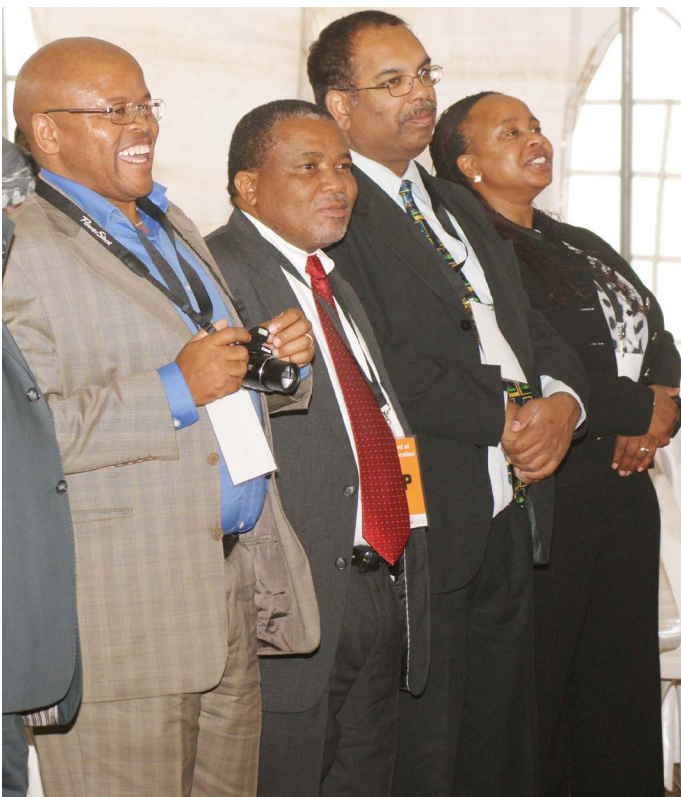
DBE officials at the Nobantu launch