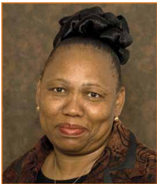
Mrs Angie Motshekga, MP Minister of Basic Education