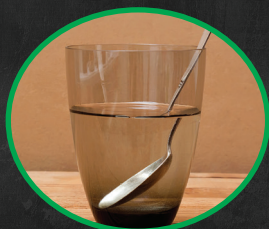
2 tablespoons water