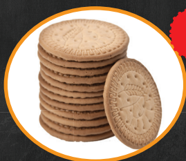
12 Marie Biscuits