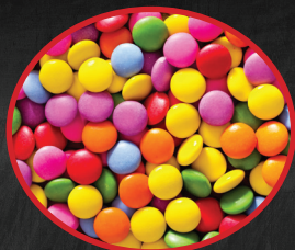
Smarties and Jelly Tots