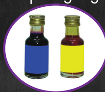
\frac{1}{2} teaspoon of blue food colouring, and \frac{1}{2} teaspoon of yellow food colouring