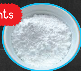
1 cup icing sugar