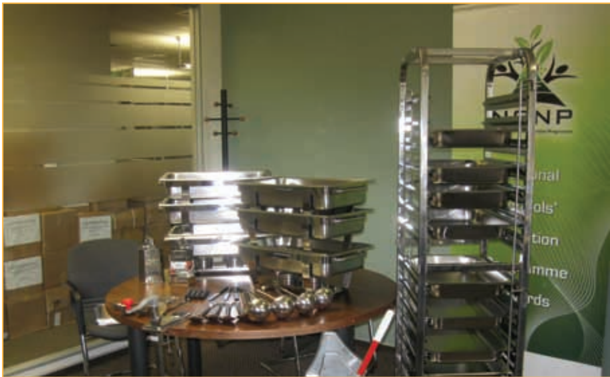
Catering equipment bought for all schools nominated in the NSNP Best Schools Awards

During the 2010/11 financial year, the Department will continue to prioritise the provision of quality meals through strengthened monitoring, research, partnerships and advocacy.