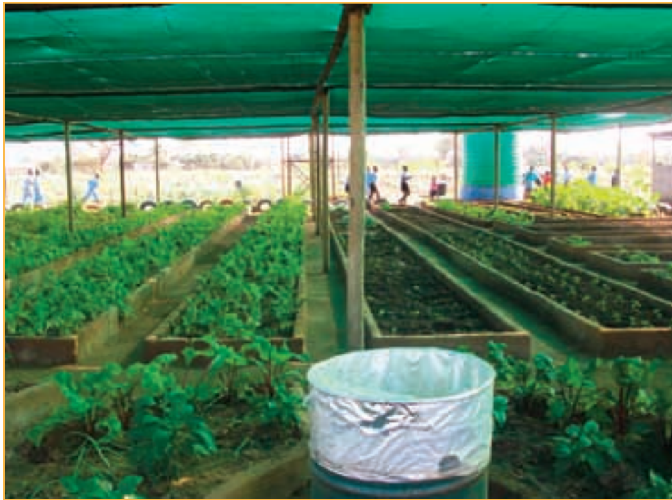
The vegetable garden at Lugeplane Primary School, Mpumalanga