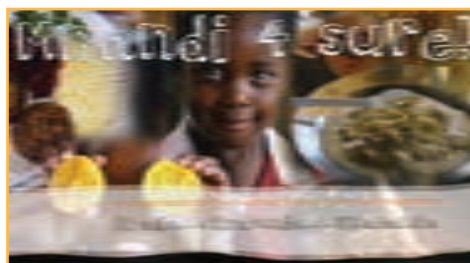
Mnandi 4 sure NSNP recipe book

"The Best of National School Nutrition Programme" was developed to show-case best practice in implementing the programme at the school level. Stories from all provinces are captured to demonstrate what is possible with innovation and hard work. Both publications are on the Education website www.education.gov.za .