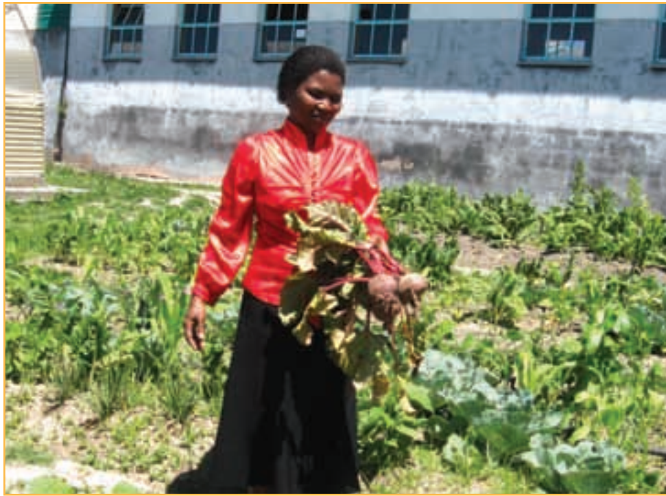
School coordinator harvesting beetroot (Londolozani Junior Primary, Eastern Cape)