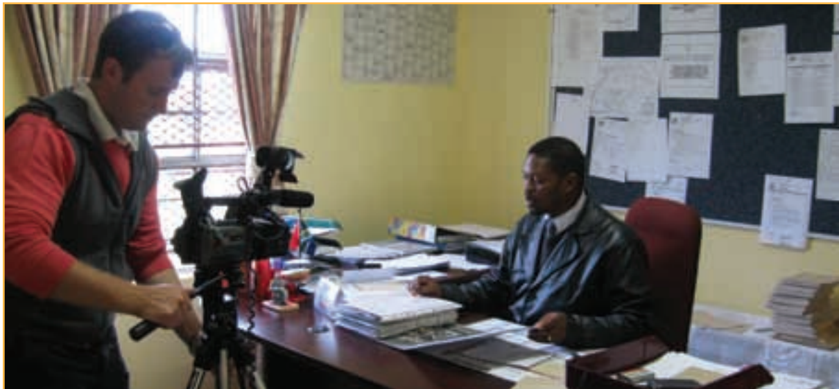
DVD shoot for NSNP Best School Awards (Ebomvini Primary School, KwaZulu-Natal)

Meals provided follow the Food Based Dietary Guidelines, which provide for a variety of food items inclusive of vegetables and fruit.