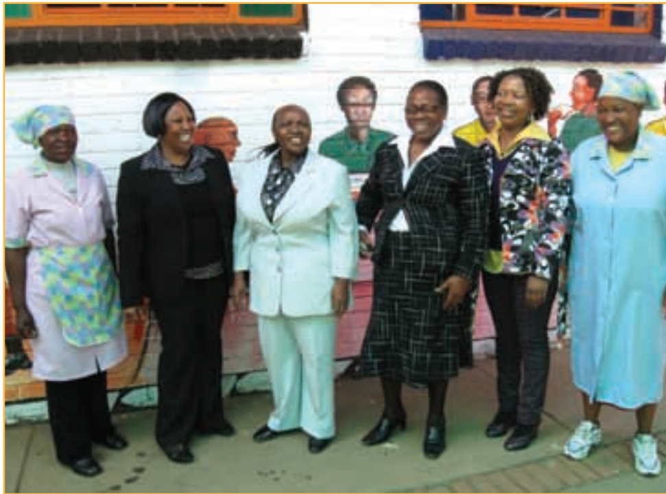
NSNP school committee with Volunteer Food Handlers (Pula Difate Primary, Gauteng)