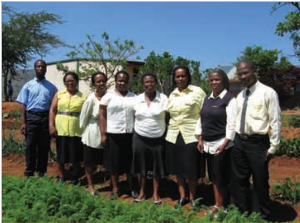
NSNP School committee (Zubane Junior Primary, KwaZulu-Natal)