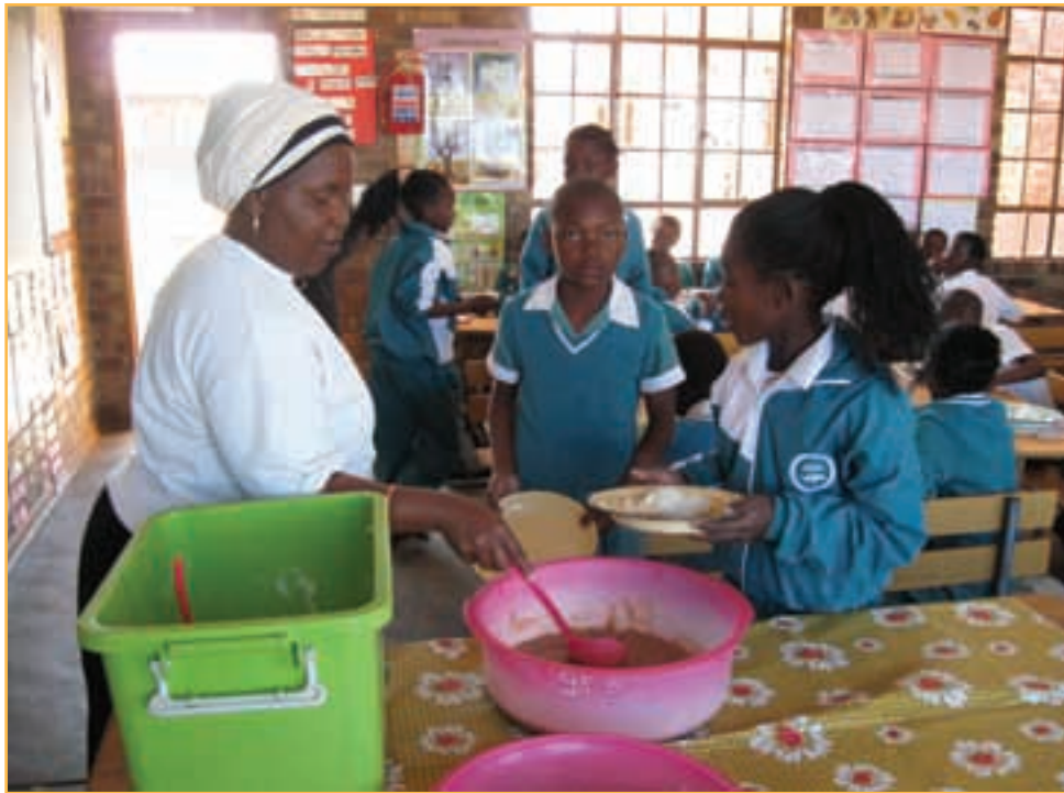
An educator dishing up food (Rampuru Primary School in Limpopo)