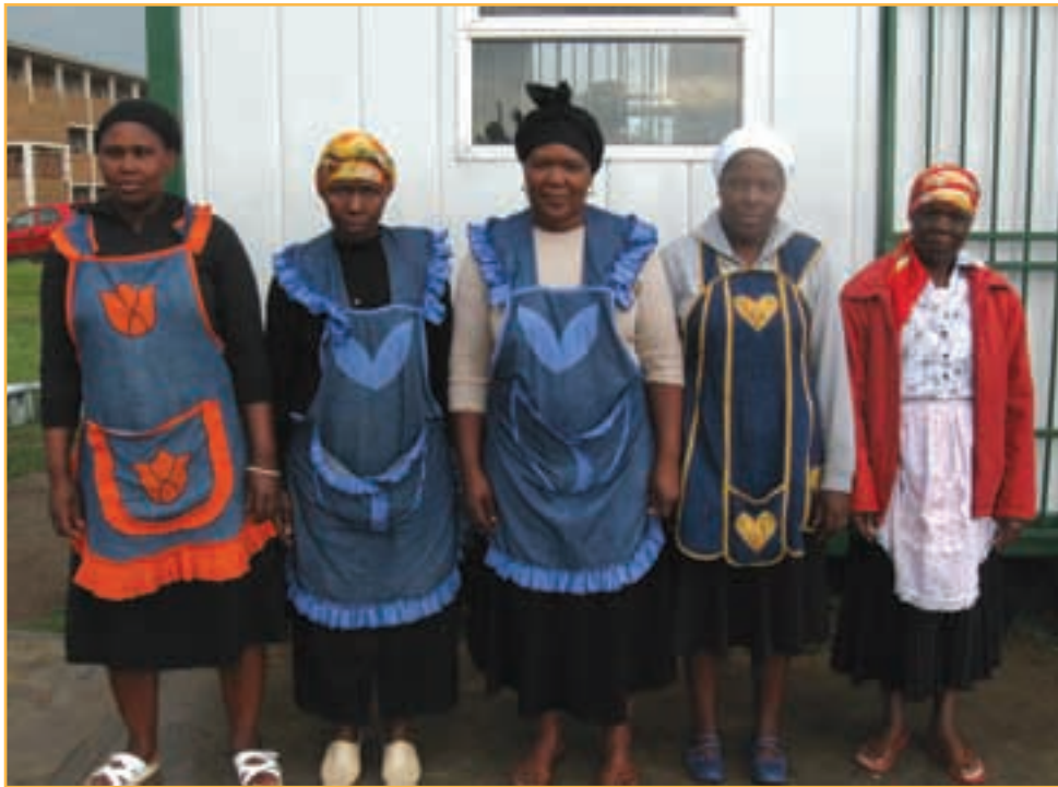
Volunteer Food Handlers wearing colourful aprons (Ditshabatsohle Primary, Free State)