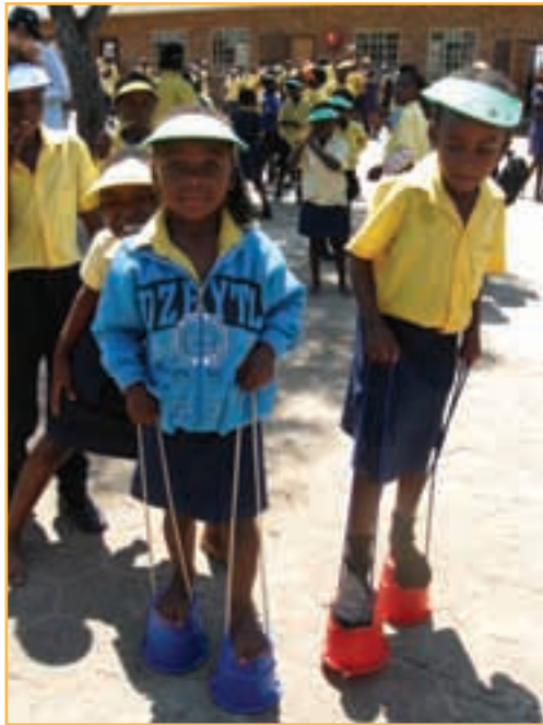
Learners play physical games during National Nutrition Week (Maokeng Primary School, Limpopo)

A system of ranking and funding schools taking into account the socio-economic circumstances of learners (inequality and poverty). For example, the poorest quintiles (1 and 2) receive more funding in terms of the Norms and Standards for Funding Schools.